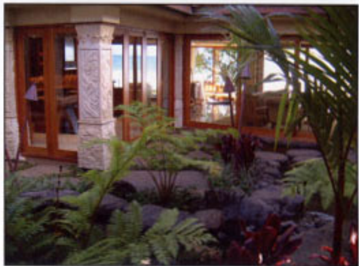
TOP: Different ceiling fan designs are used through the home. Some feature fan blades carved like palm leaves. This bedroom opens into the central courtyard (above).

Harada's veneers, the (seemingly) antique plaster walls, and the green-patina'd, sloping, Asian-style roof, combine to create that 1,000-year-old Himalayan monastery feeling. The home's art and furnishings further enhance the mood of an